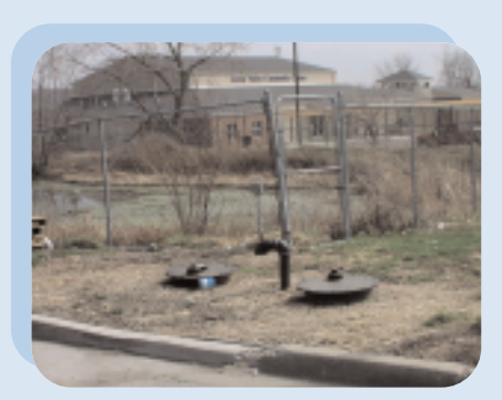
SURFACE WATER RUNOFF ASSESSMENTS AND BENTHIC MACRO INVERTEBRATE INVESTIGATION AND SAMPLING