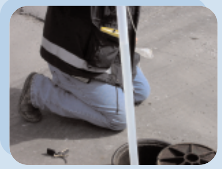
GROUNDWATER MONITORING AND INVESTIGATION