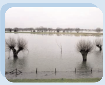
DRAINAGE CATCHMENT STUDIES